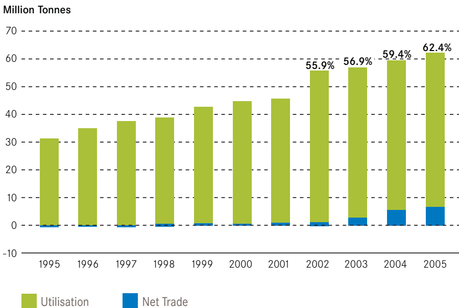
Figure 3: Historic Progress in the New Declaration Area, Including Exports

However, both these changes make it impossible to compare the First Declaration period directly to the New Declaration. To facilitate such comparisons, Figure 3 shows historical developments in the 29 countries of the New Declaration, including the recovered paper net trade (under the new calculation method) and recovered paper utilisation.